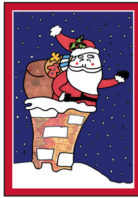
Card #3 ~ Rooftop Santa