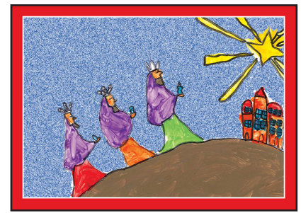
Card #4 ~ Rejoice!

Orders must be placed by November 15, 2017