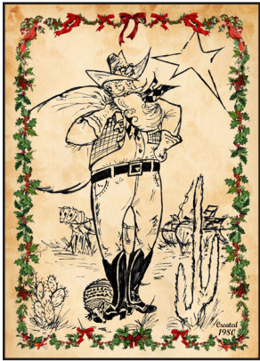
Card #1 ~ Special Edition 70th Anniversary Card